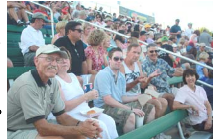
Take me out to the ball game