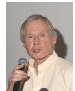
Noel Wheeler Addition to Chico Air Museum