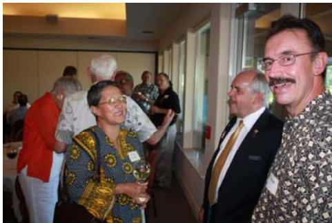
Reception for the Kimaros