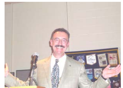
Fine the Prez Another gaffe!